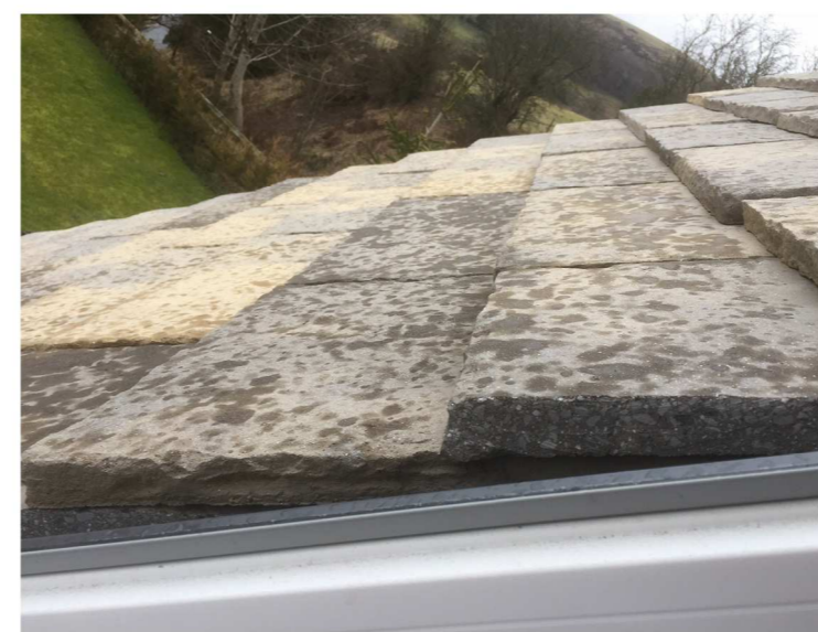
PROPOSED ROOF COVERING 'BRADSTONE TILE'