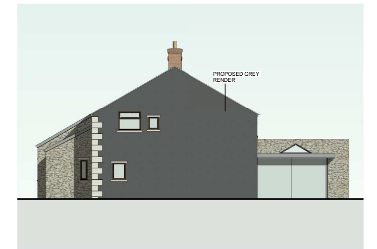
South east elevation