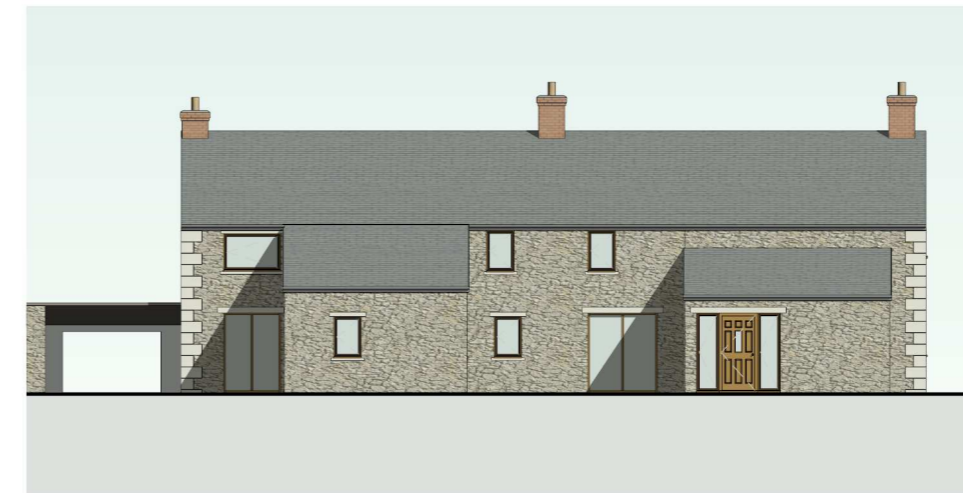
South west elevation