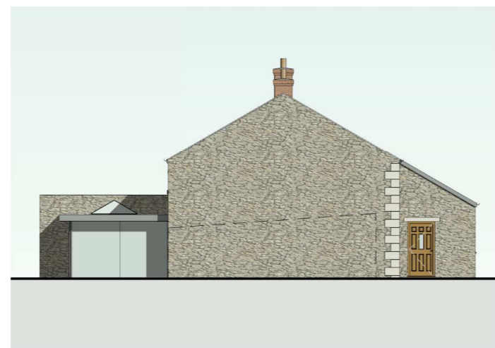
North west elevation