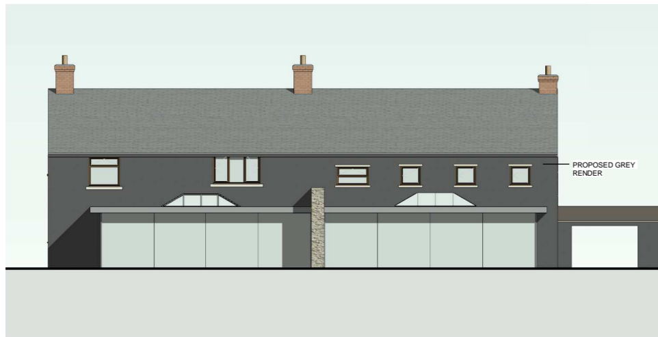
North east elevation

CUCKOLDMANS FARM, BLACKSNAPE, DARWEN, LANCASHIRE, BB3 3PP