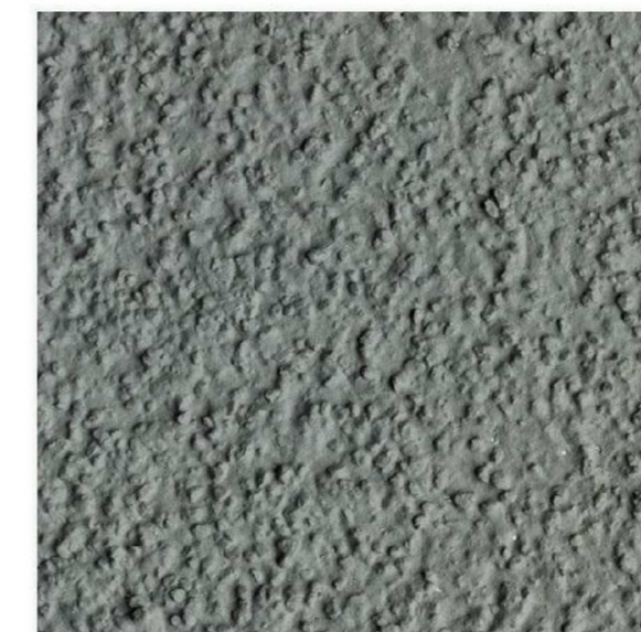
PROPOSED RENDER TYPE - 'CAUSEWAY GREY'